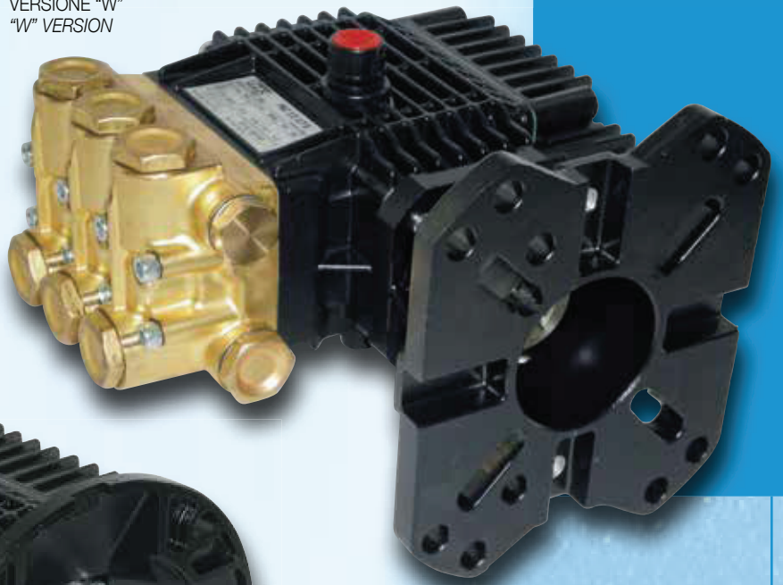
VERSIONE "W" "W" VERSION