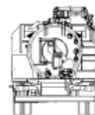
technical drawing KanRo COMBI 3000