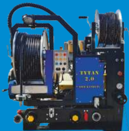
TITAN 2.0 - 200/70