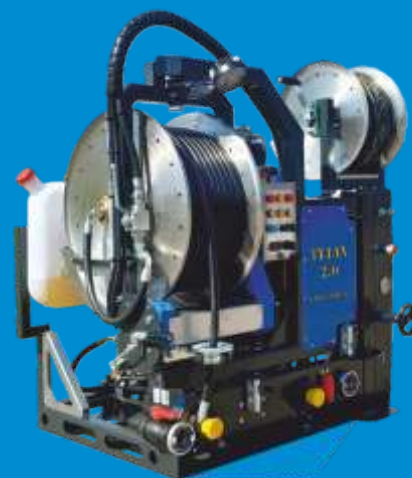
TITAN 2.0 - 150/120*