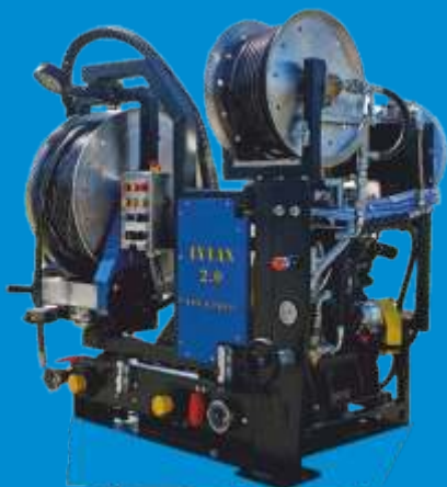
TITAN 2.0 - 150/100